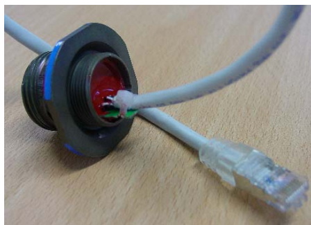
RJF TV 7SA2 G 05 100BTX